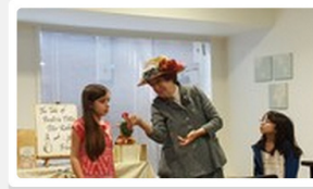
"Beatrix Potter" by The Music Center