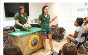
Wildlife Learning SD Zoo