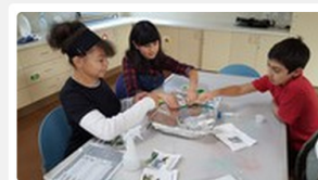
Chino Water Basin