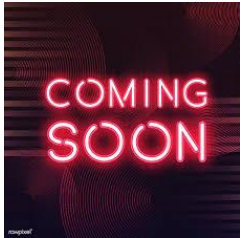
Director of Operations