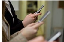
Parent Scholar Portal