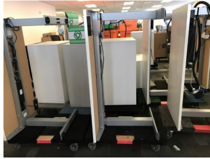
Loading Content onto Equipment