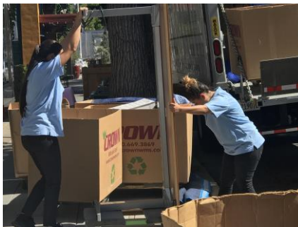
Delivering to Truck