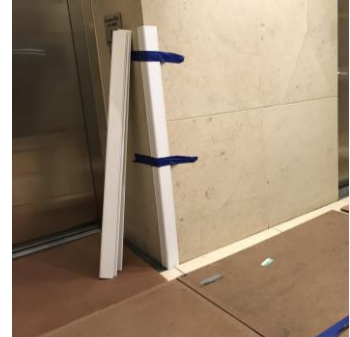
Wall Corner Protection

During the move, the Crown team will lay floor, wall and corner protection throughout our path of travel. At both origin and destination. Masonite for the floors, corner boards for each corner and corrugate for the walls.