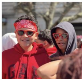
GRADE 7 "THIS IS WHAT WE DO"