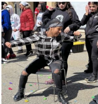
G8 DRUMLINE + CHANT!