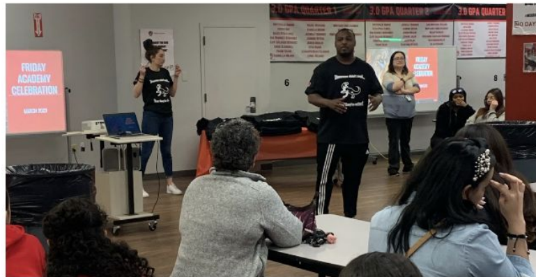
UCONN MORNING CHAT!