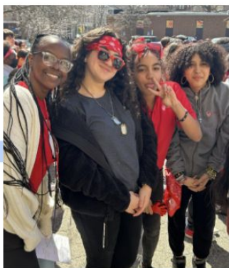
BALLOON POP MADNESS!