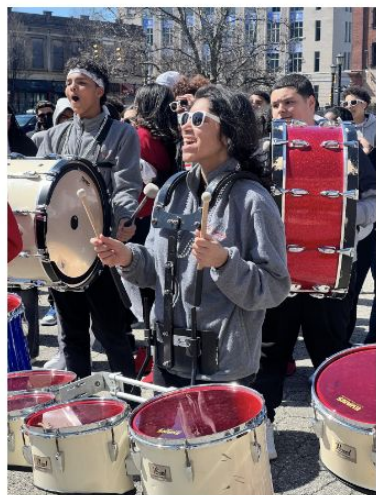
GRADE 6 "THIS IS WHAT WE DO"