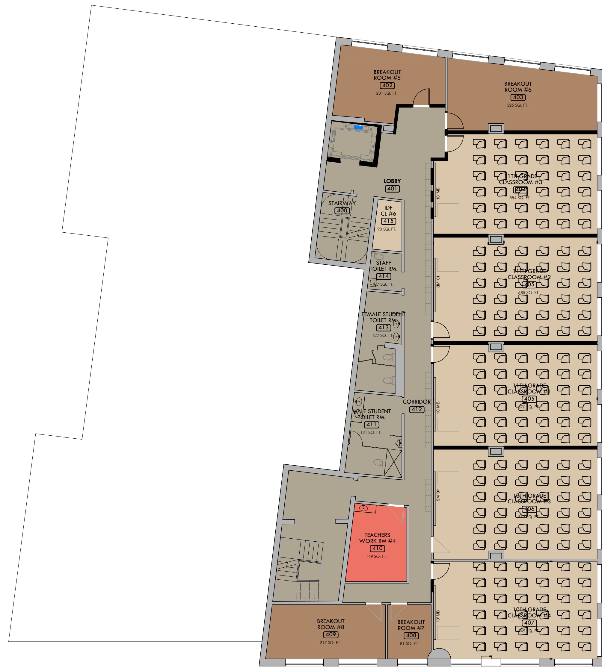
Fourth Floor Plan