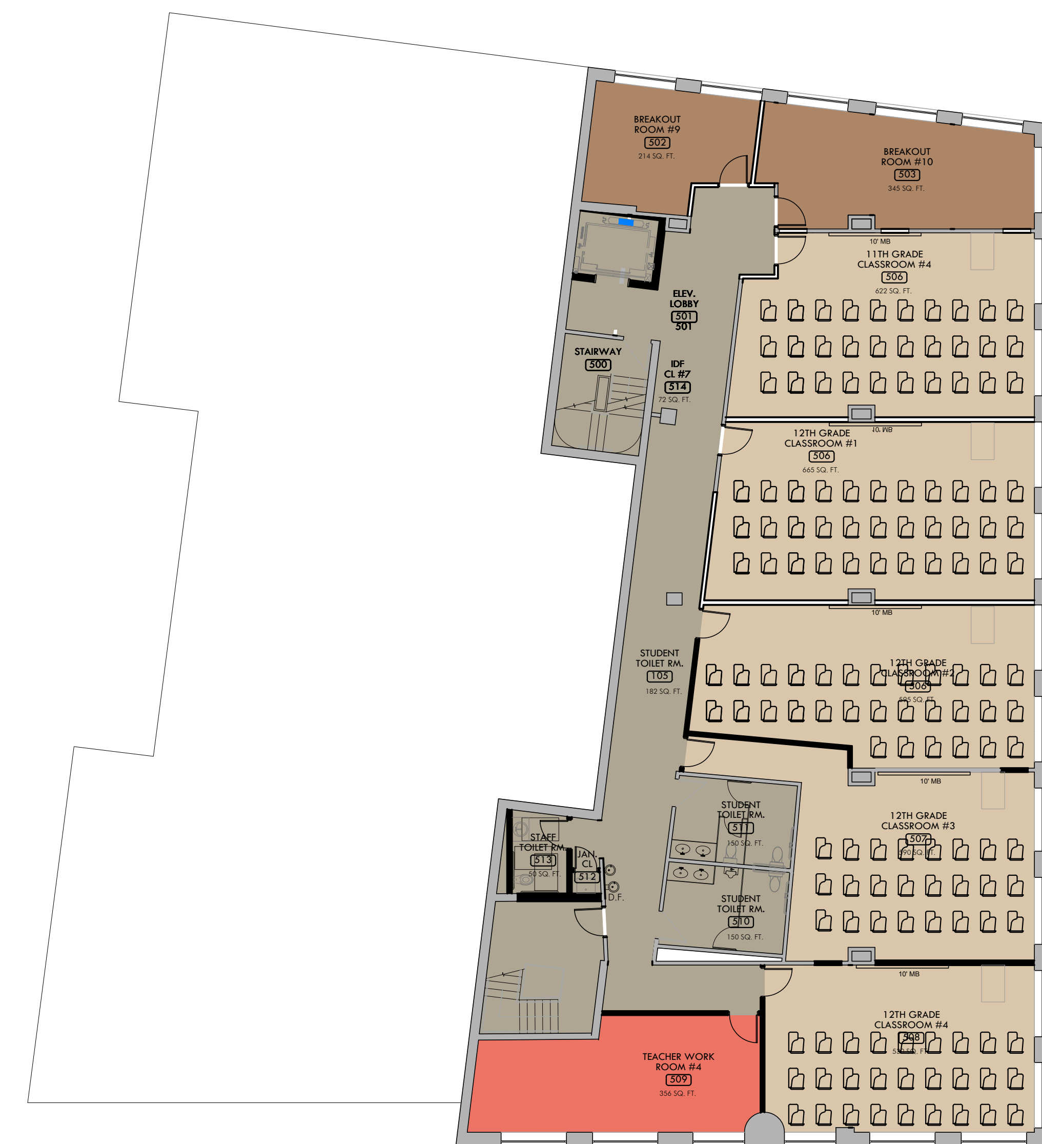
Fifth Floor Plan