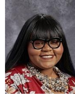
Head of Division for Academics High School