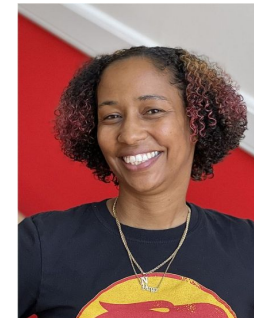
Dean of Students, High School