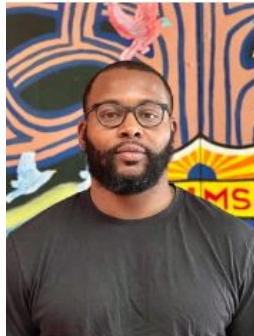
Dean of Students, Middle School