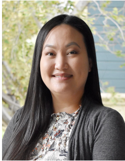
Head of Division for Academics Elementary