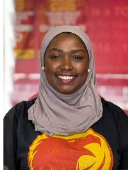
Head of Division for Academics Middle School