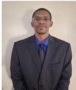
Dean of Students, Elementary