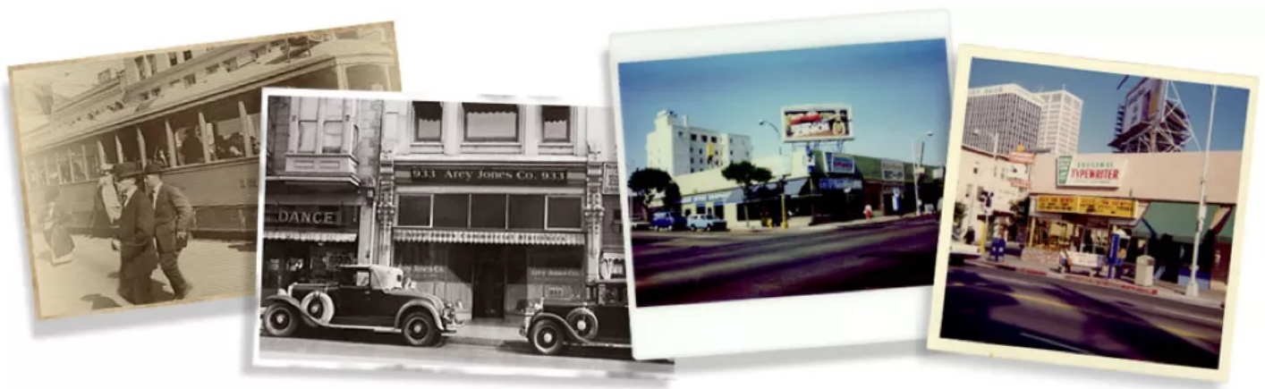
Arey Jones first location in San Diego, CA

Headquartered in San Diego, California, Arey Jones was founded in 1897 to serve the stationary and administrative needs of the local educational market. In 1972, Arey Jones was purchased by Broadway Typewriter Company, owned by the Scarpella Family. Since that time, the Scarpella Family has operated and expanded the business as Arey Jones Educational Solutions.