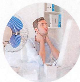
Reduce fan usage