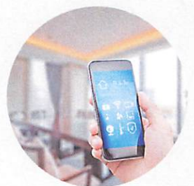
Monitor and control remotely via app