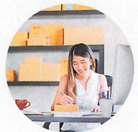
Improve indoor air quality