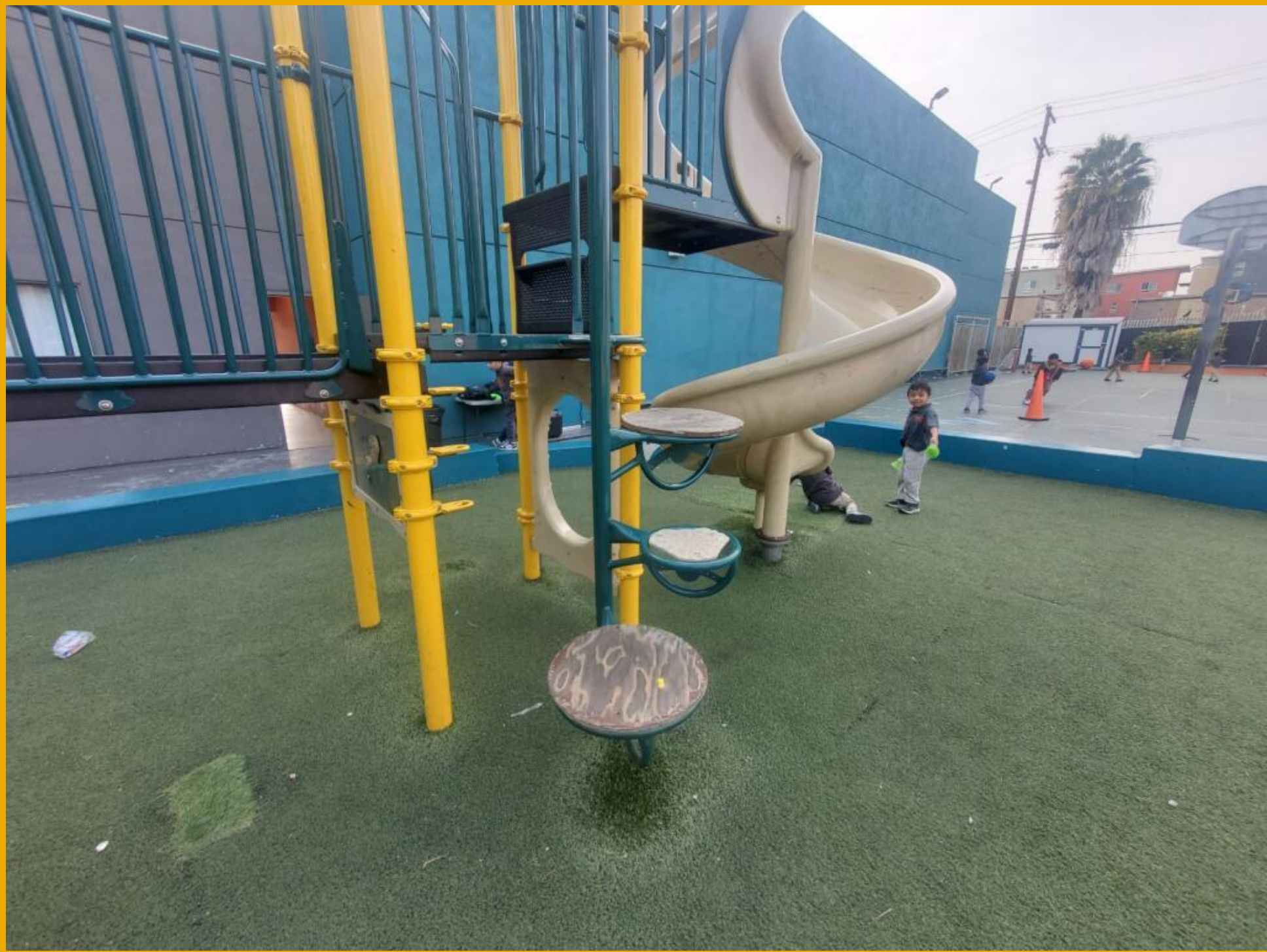
EXISTING PLAY EQUIPMENT