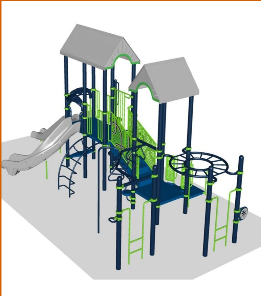
Camino Nuevo Burlington 5-12 SE VIEW