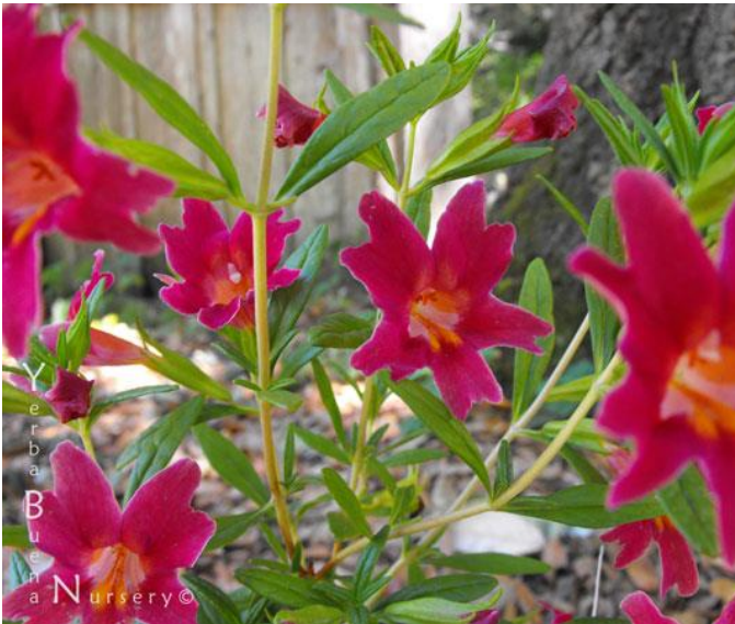
Mimulus 'Jelly Bean Red'