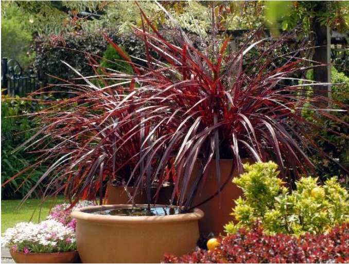
Cordyline x. 'Festival Burgundy'