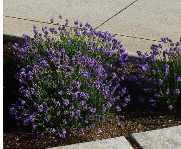
Lavandula a. 'Thumbelina Leigh'