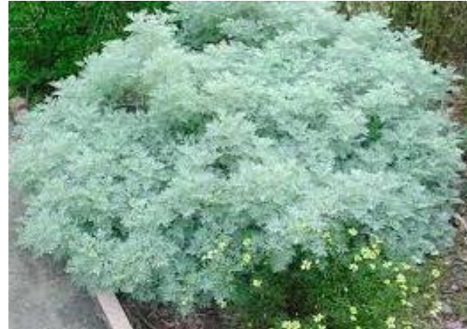
Artemisia 'Powis Castle'