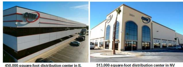
450,000-square-foot distribution center in IL

CDW holds more than $300M of available inventory in our two CDW-owned distribution centers that total almost 1M square feet. Our ISO 9001, 14001 and 28000 certified strategically located distribution centers provide speed, accuracy, and excellent geographic coverage across the United States. We have access to more than 100,000 top brand-name products from more than 1,000 leading manufacturers.