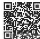
LAS VEGAS SUMMIT

Each registration incurs a $7 per person order processing fee.