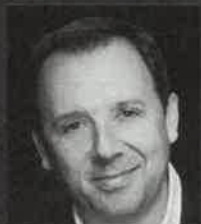
Ron Suskind Pulitzer Prize- winning Journalist, Filmmaker and