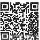
NEW YORK SUMMIT