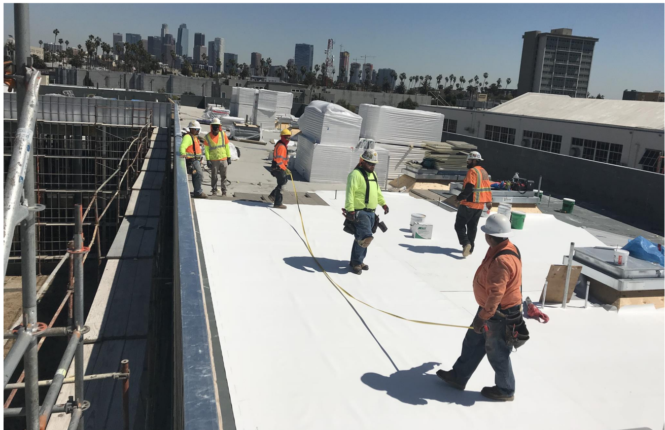
Installation of roofing at bldg. C south.