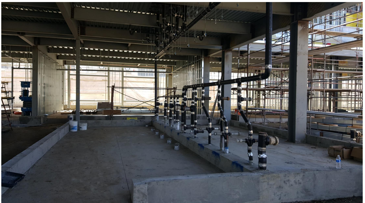
Installation of interior metal stud framing in progress at bldg C south, 1st floor. Installation of all MEP in progress at 1 st floor restrooms, bldg C.