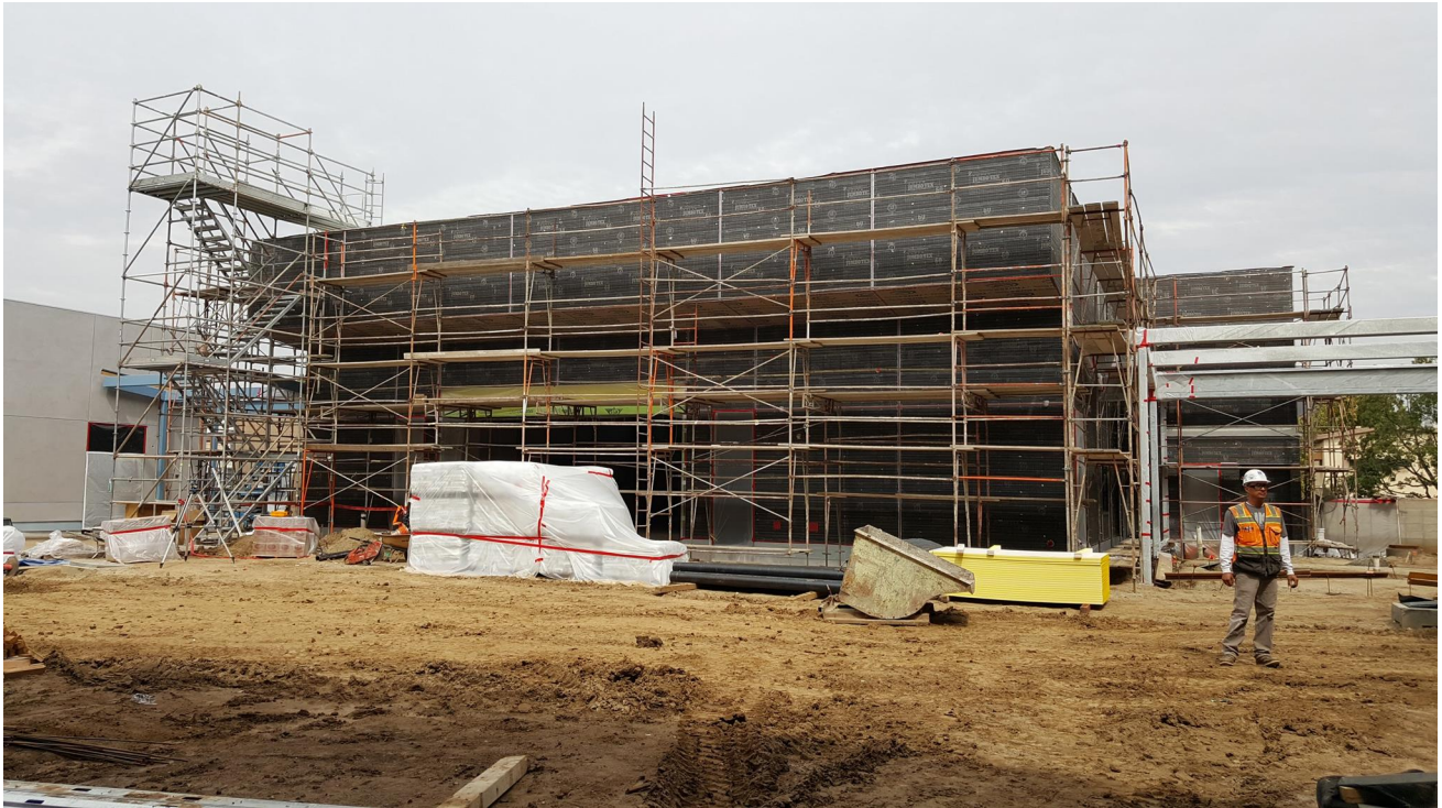
Exterior sheathing installation in progress at bldg. B.