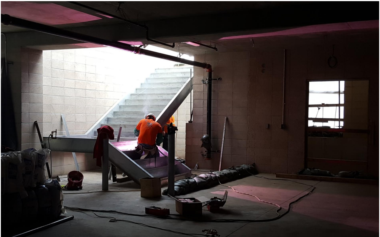
Installation of steel stairs in progress at underground parking garage north.