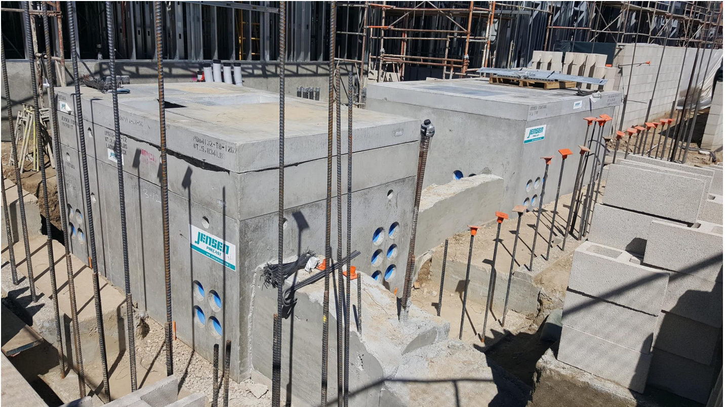
Transformer and Switch concrete vaults installation at the Electrical Yard. CMU wall installation at the electrical yard and utility yard in progress.