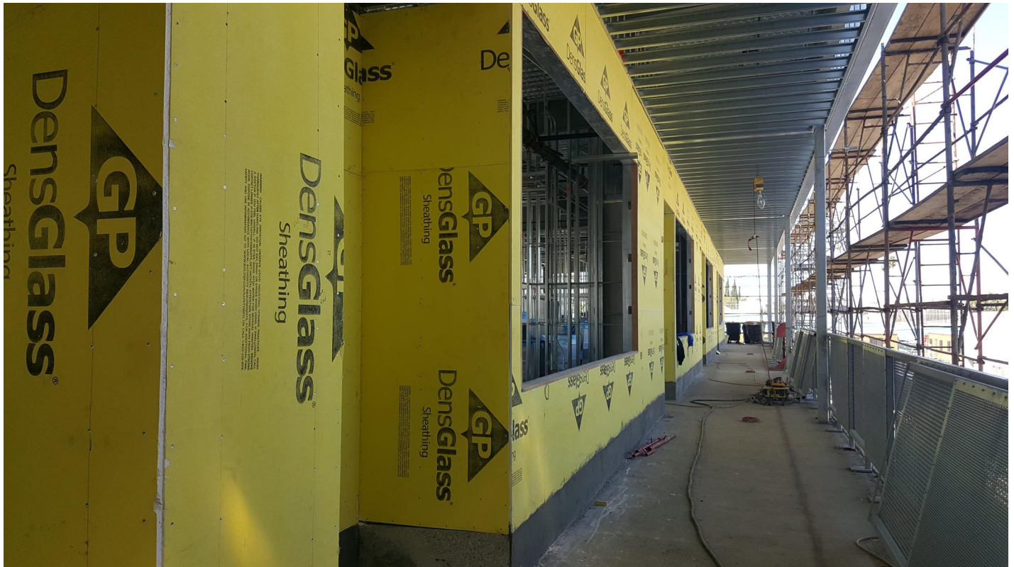
Exterior sheathing and walkway railing installation in progress at bldg C south.