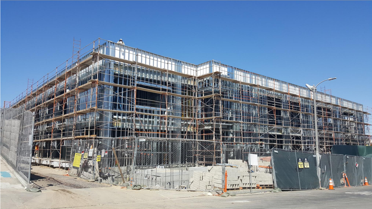
Installation of exterior and interior metal stud framing in progress at bldg. C south and east wing. Installation of transformer and switch concrete vaults at the electrical yard completed.