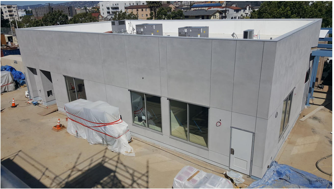
Window glazing installation completed at bldg. A