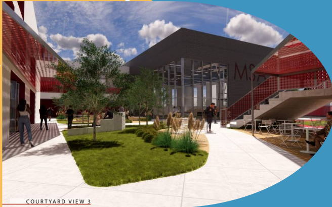
COURTYARD VIEW 3