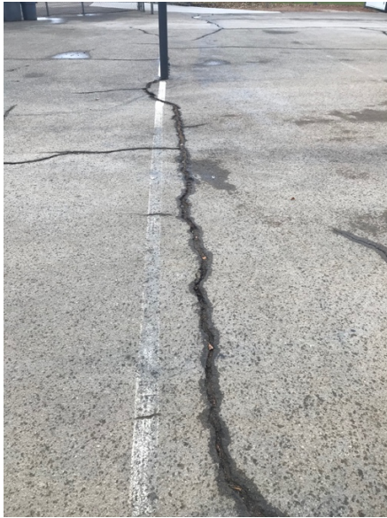
Asphalt at Basketball Court