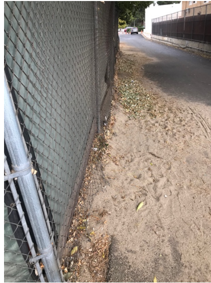
Retaining Wall at Playground