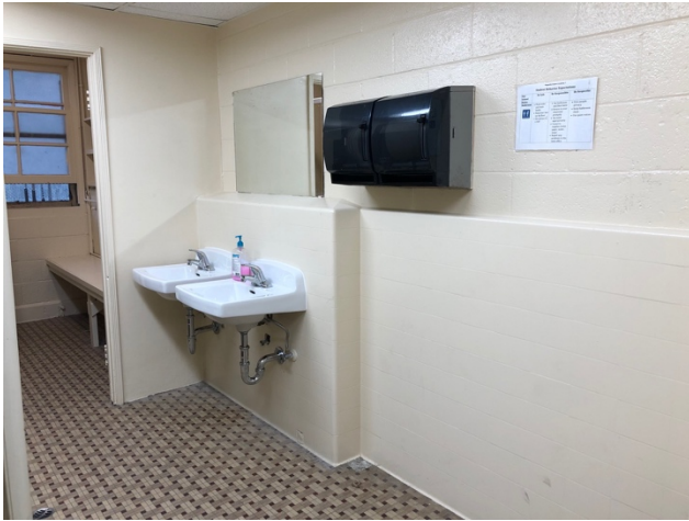
UPDATED STUDENT RESTROOM