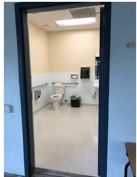
NEW STAFF RESTROOM