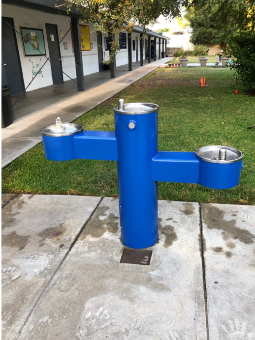
FUNCTIONAL WATER FOUNTAIN!