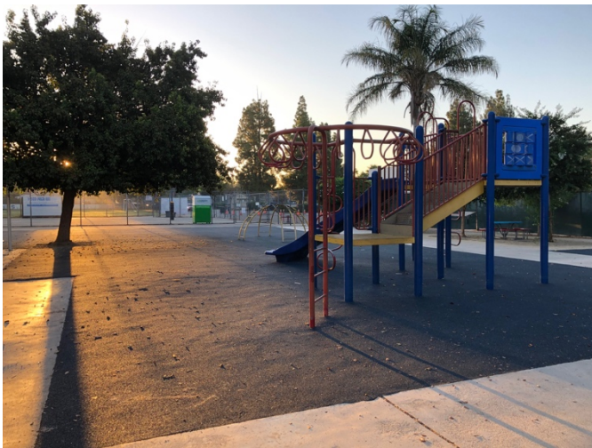
NEW PLAY SURFCE (NO MORE SAND!)