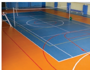
Suitable for multi sports, including volleyball, basketball & aerobics.