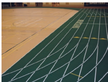
Non-porous, anti-microbial design resists bacteria and odors.

Connor Sports • 800.283.9522 • info@connorsports.com • connorsports.com