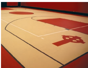
Acknowledge your team with custom logos and mascots.