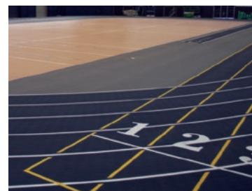
Optional recycled rubber base layer qualifies for LEED® credits.