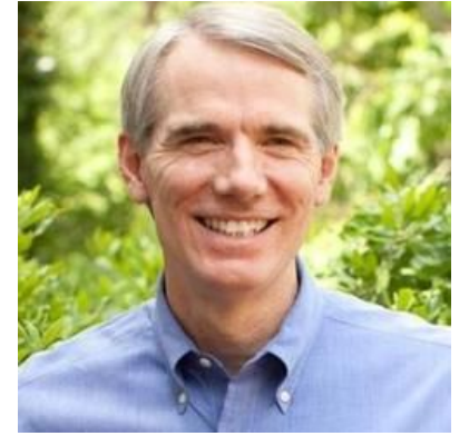
Sen. Rob Portman R-Ohio