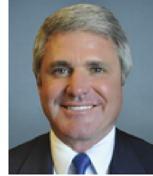
Rep. Michael McCaul, R-Texas