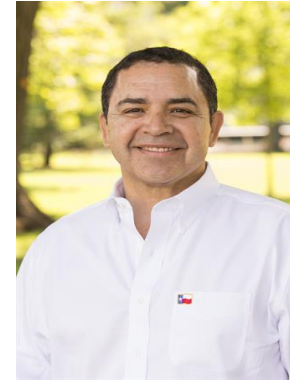
Rep. Henry Cuellar, D-TX