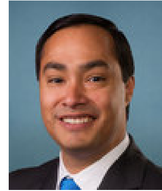
Rep. Joaquin Castro, D-TX