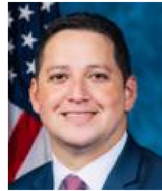
Rep. Tony Gonzales, R-TX