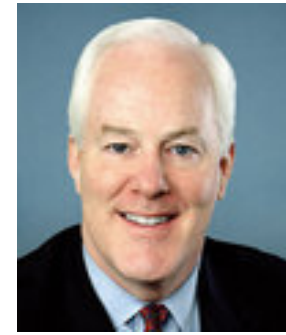
Sen. John Cornyn, R-TX