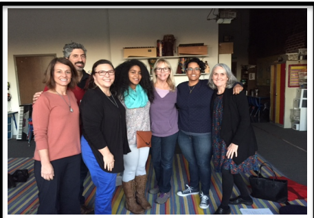
Experienced educators; Cognitively-Based Compassion Training