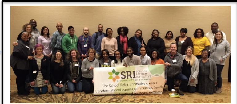
Experienced educators, Critical Friendship meeting