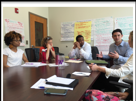
Cultural Competency training

CREATE and ANCS work in close partnership with 1) Georgia State University's College of Education and Human Development (GSU CEHD), a college focused on preparing teachers for urban settings; 2) Atlanta Public Schools district; an urban district serving 55,000 K-12 students, 78% of whom qualify for free and reduced price lunch; 3) the School Reform Initiative (SRI), a non-profit organization committed to educational excellence and equity through supporting teachers in reflective collaboration and engagement in Critical Friends Groups (CFGs); 4) the Emory-Tibet Partnership at Emory University (ETP) a center focused on mindfulness to increase resilience in the face of workplace stress; and 5) several charter and traditional public schools that serve historically-marginalized communities within and near the Maynard Jackson High School "cluster". Finally, CREATE also partners with Empirical Education of Palo Alto California for the close monitoring and evaluation of the program.