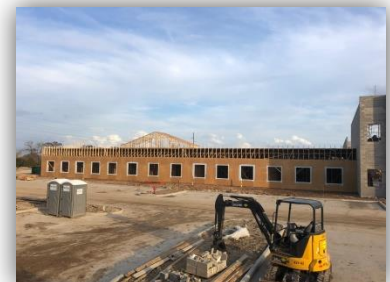
Area B Front