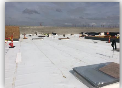
Roof Area A North