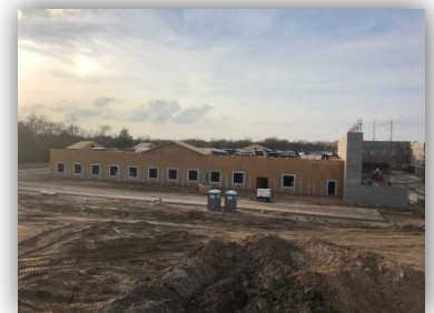
Area A Back