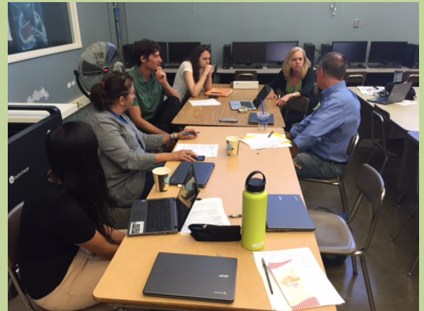
SLC teachers at work!