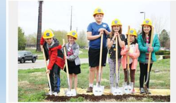
Elementary and middle school students at STEM School Highlands Ranch kick off the groundbreaking of the campus' first grass field and playground.

Students have used parking lot in years since school opened