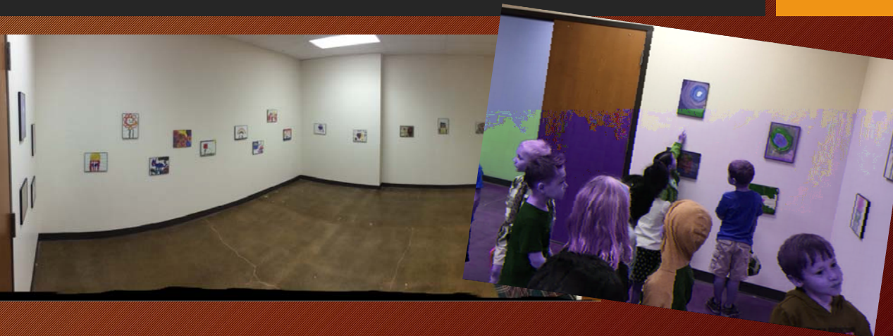
Art Gallery in a storage room- students are proud of their contributions