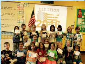
First Grade Election Day- Duck won!