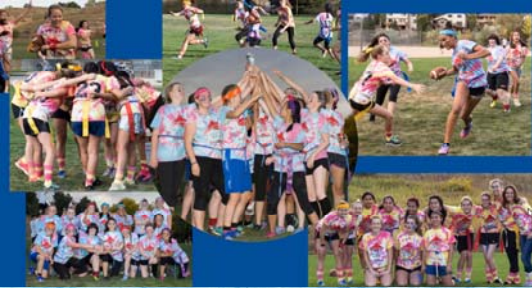
High School Spirit