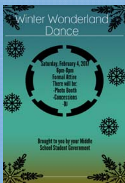
Photo Booth at Snow Ball