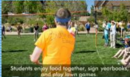
Students enjoy food together, sign yearbooks, and play lawn games.