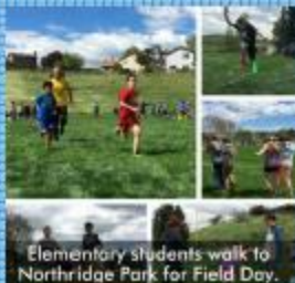
Elementary students walk to Northridge Park for Field Day.