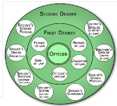
AFFINITY KINSHIP Relationship by Marriage